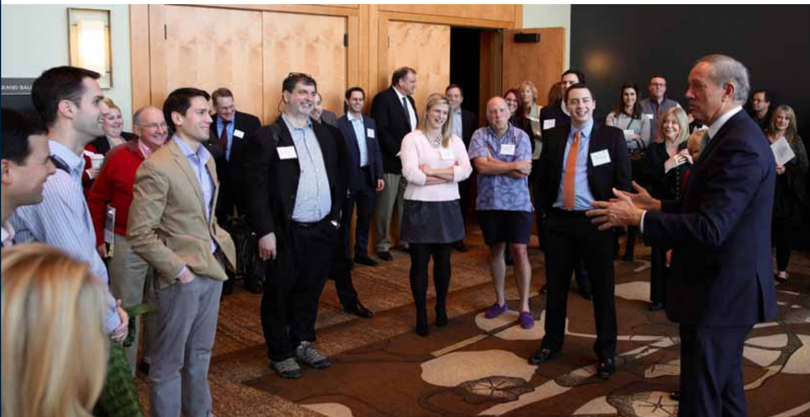
Former New York Governor George Pataki addresses WPC's Pillar Society and Young Professional members at a private reception following WPC's 2015 Solutions Summit.