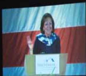
Gov. Susana Martinez addresses the crowd at WPC's 2015 Annual Dinner event.

In 2015, we welcomed our largest crowd in Spokane and Bellevue, including a packed Young Professional Dinner event! As a benefit of joining WPC's Pillar Society, members are not only guaranteed a table or tickets for the Annual Dinners, but given priority Pillar Society seating each year of their pledge. For more information about this exciting event, visit www.washingtonpolicy.org/annualdinner .