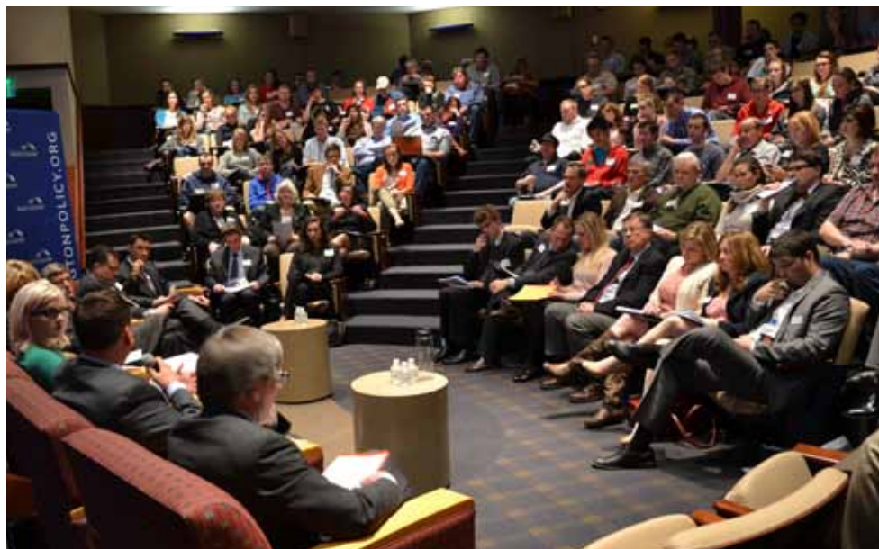
Over 100 students, community and political leaders attended WPC's WSU Minimum Wage Debate in February 2015 featuring a panel of economists, experts and activists. Debates at UW and Gonzaga will be held in April 2015.