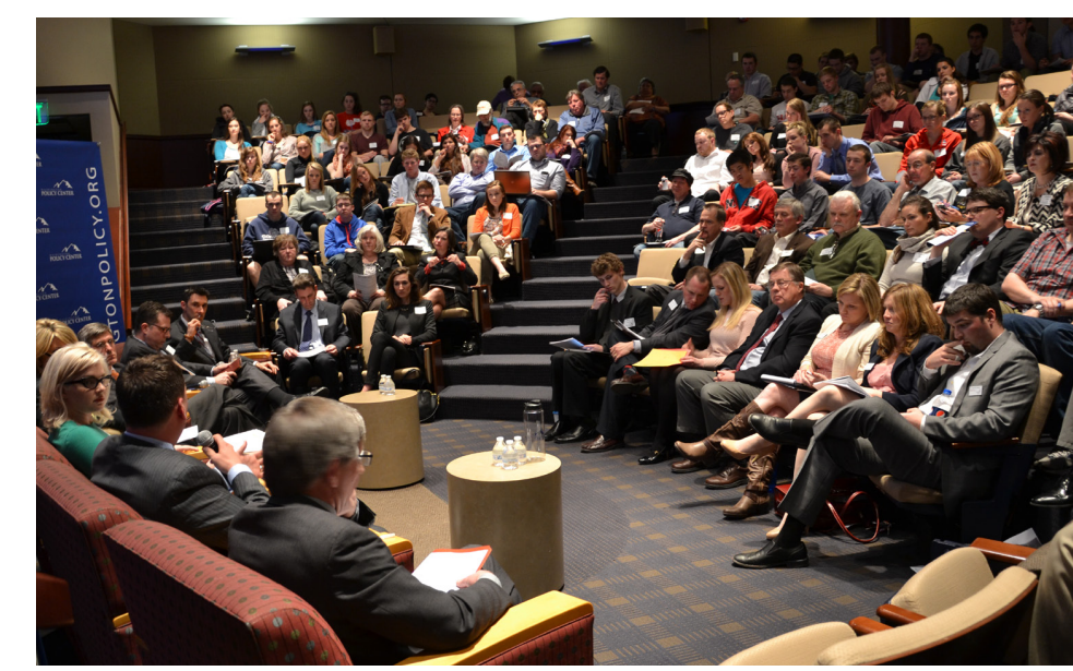
Over 100 students, community and political leaders attended WPC's WSU Minimum Wage Debate in February 2015 featuring a panel of economists, experts and activists. Debates at UW and Gonzaga will be held in April 2015.

We hope you will consider joining our Pillar Society. We are on your side and we are honored to have your trust. For more