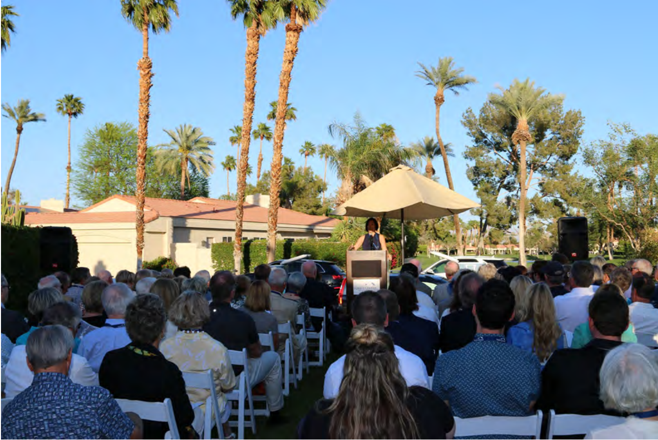
Above: Annual Evening in the Desert in Palm Springs. Pillar Society members hear from former Washington D.C Chancellor of Public Schools Michelle Rhee