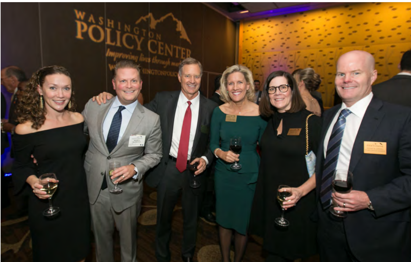
Below: Pillar Society members enjoy the VIP reception at the Annual Dinner in Bellevue